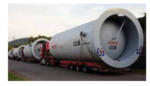
Supply of sheets of P355GH quality for the company Kasper Kovo s.r.o.