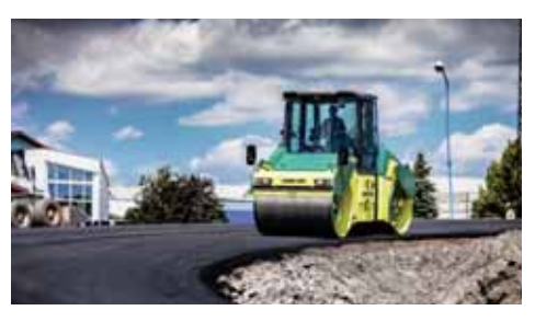
Reinforcing steel supply to the company H.A.N.S. stavby a.s.