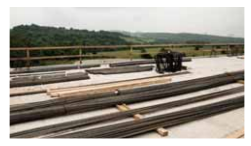
D8 highway, construction No. 0805 Lovosice -Řehlovice, part A – highway line A 215 – highway bridge over road No. III/258 29 ŽIM -Řehlovice