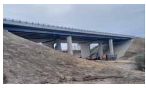
Bridge for the town of Měřín