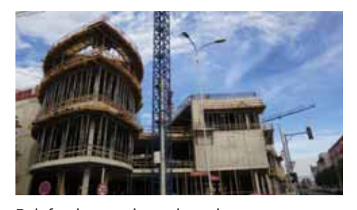
Reinforcing steel supply to the company FERI, s.r.o. Hradec Králové.