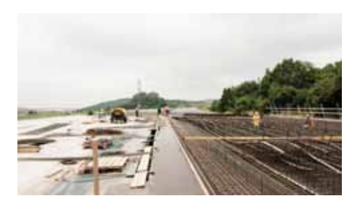
Reinforcing steel supply to the company STAV-TECH-CAR